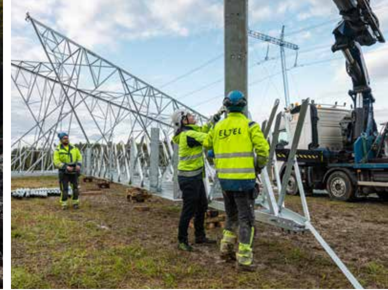
Cranes and other work machinery operating near the live line are earthed with care.

he sturdy concrete foundation has set, and the next transmission line tower will soon be erected by crane. Elsewhere, lines are already being installed on towers using a puller and tension machine. The line is strung on pulleys and earthed with